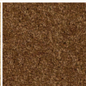
FW135 Morton Malt