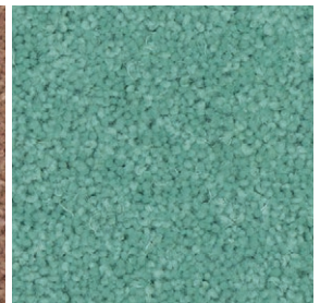
FW133 Shelsley Spa