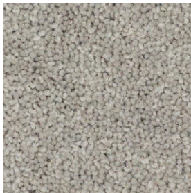
FW130 Martley Mist