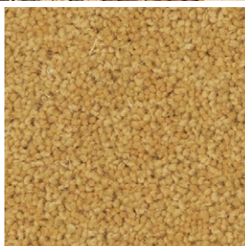
FW132 Hampton Hive