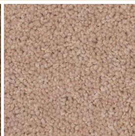
FW127 Longdon Lace