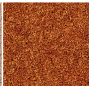
FW136 Upton Umber