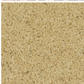
FW131 Hopwood Hemp

Global Traveller – Warm earthy tones & bold finishes. Aztec patterns and weaves in various scales, inspired by colours, landscapes and textures of long awaited travel and adventure.