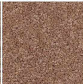
FW129 Stoulton Stone