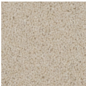
FW134 Crofton Cloud